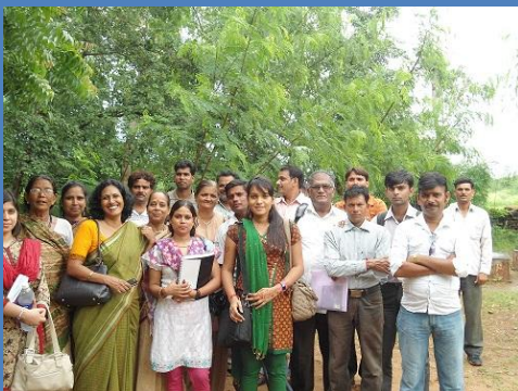
Team of participants in SAMBHAV during ToT Programme