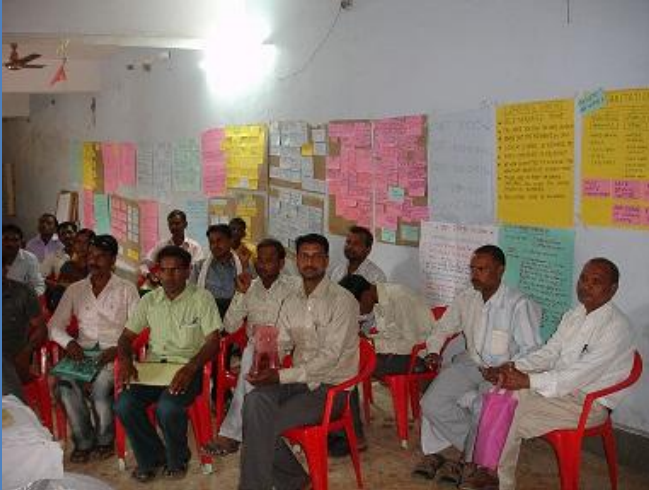
Participants from ASSET in ToT Programme